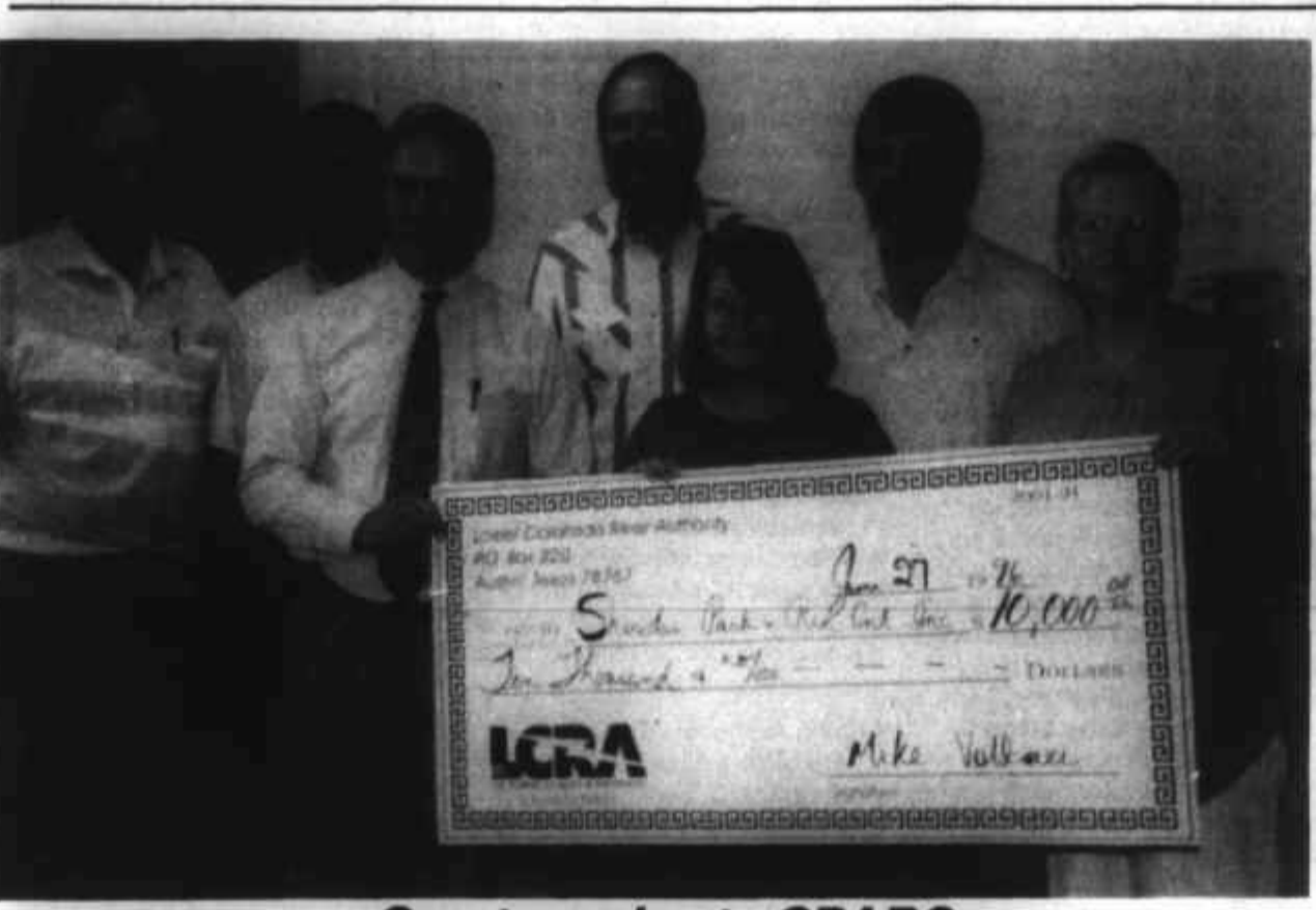
Grant monies to SPARC Sheridan Park and Recreation Center Inc. (SPARC) recently received a check for $10,000 from the Lower Colorado River Authority (LCRA).